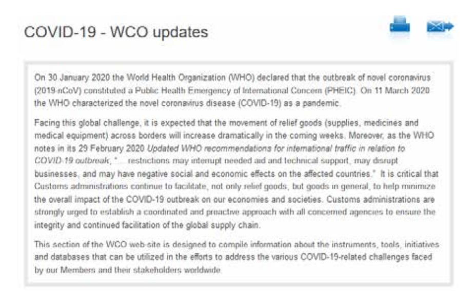
Fig. 1. WCO Special dedicated site for the COVID-19 outbreak

As early as 20 March 2020 the WCO reacted and openly was pulling all internal and external strings of its global network in order to communicate sober stringent helpful messages to the customs administrations, customs officers and the general public and businesses<sup>4</sup> and a guide of how to best communicate in a global crisis was also published<sup>5</sup>.